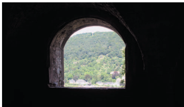
Views from the Castle in Heidelberg and the Stunning Scenery

The volume of work undertaken at Heidelberg is extraordinary and far in excess of what would be typically be expected for a unit of its size in the relatively small (although breath-taking) city of Heidelberg. The department practices an extremely aggressive approach in determining resectability of pancreatic cancers and their ethos and approach to pancreas cancers was extremely interesting to observe. Research also forms a major component in the unit and a regular procession of research fellows would attend each pancreatic resection to sample blood or bone marrow. I was made to feel extremely welcome I would hope to visit again in the future.