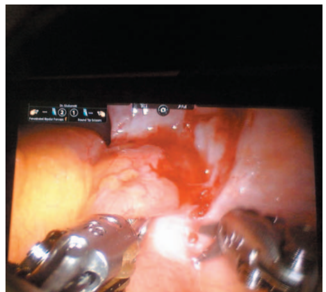
Intraoperative view of Robot in use