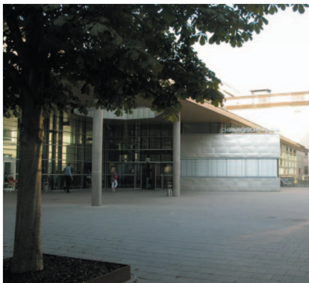
Department of Surgery in Heidelberg

The University Hospital of Heidelberg is one of the largest and most renowned medical centers in the Federal Republic of Germany. It is closely linked to Heidelberg University Medical School (Heidelberg University Faculty of Medicine) which was founded in 1388 and is thus the oldest within the Federal Republic of Germany. The Department of Surgery has a major pancreatic unit, which undertakes over 400 pancreatic resections per year.