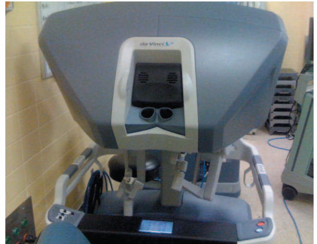
Actual Surgical Robot